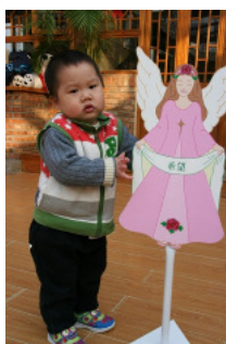
Alenah's Home Beijing, China

We will continue to send wooden Angels of Hope to orphanages, clinics, safe houses and other facilities, along with colorful Love is Real t-shirts, Angel Coloring Books and mini cards.