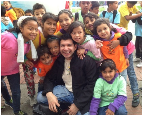
Orfanato Mis Chiquis, Bogota, Colombia

We firmly believe that within us all is an unlimited power to care, to get up and open to that courage inside, to do something to make a difference, to really care about other human beings, and to truly live compassion through service.