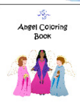
Angel Coloring Book