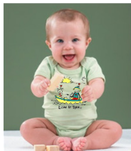
Love is Real t-shirts (onesies for infants) (with mini cards)