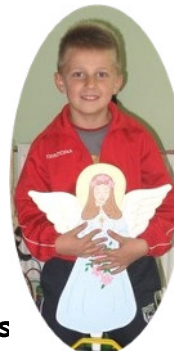
Angel of Hope