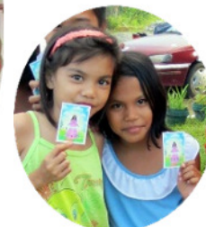
Angel Mini Cards