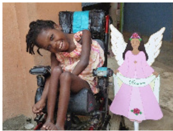
An Angel with a smiling child at Miriam Center

In the last quarter, seven more International Angels have flown across the seas to brighten the lives of children in orphanages in Haiti, Columbia, Ecuador and Russia.