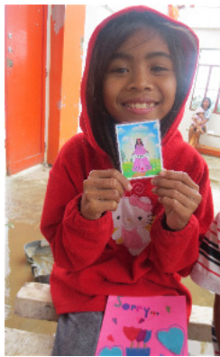
Community Center Cangumbang, Philippines