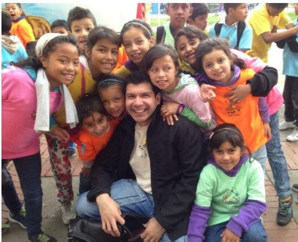
Orfanato Mis Chiquis, Bogota, Colombia

We firmly believe that within us all is an unlimited power to care, to get up and open to that courage inside, to do something to make a difference, to really care about other human beings, and to truly live compassion through service.