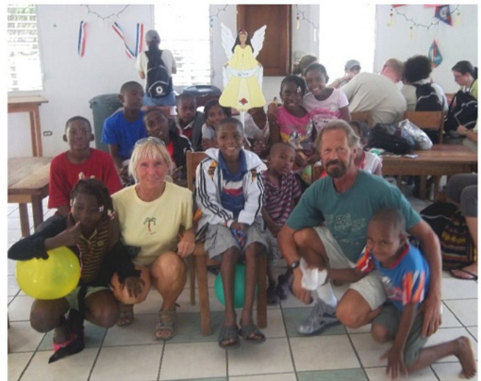
Liberty Children's Village Ladyville, Belize