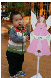
Alenah's Home Beijing, China

We will continue to send wooden Angels of Hope to orphanages, clinics, safe houses and other facilities, along with colorful Love is Real t-shirts, Angel Coloring Books and mini cards.